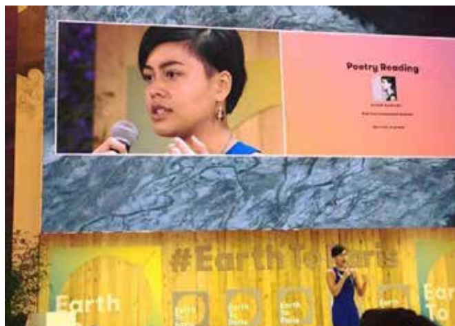
Spoken Word Campaign, Paris, France.

Fortunately, we're already seeing signs of such a stirring, in some cases spurred on from unexpected places. In June 2015, His Holiness, Pope Francis issued his epochal Encyclical Laudato si' , firing up the world's Catholics and inspiring others of faith as well. A groundbreaking study in The Lancet on the health impacts of climate change provided a rallying cry for doctors and other health professionals to join the call and march for change. More and more trade unions and workers are speaking out, insisting on a just and safe transition away from fossil fuels. From parents, to indigenous people, to youth and farmers, the list of people standing up for climate action is growing and becoming more united every day.