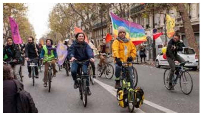
COP21 Climate March in Paris.

In collaboration with CAN-International, throughout 2015 GCCA led an initiative to drive greater alignment in post-Paris climate campaigning priorities, known as the Critical Pathways 2020 initiative. Using a combination of desk research, interviews, three outreach and dissemination events, and a survey of 115 respondents from 39 countries, we provided information on climate-related campaigns that actors across the movement believe to be most strategic for the 2016-2020 period. This will help our partners prepare for the challenges and opportunities of this new phase in climate campaigning.