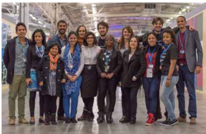
Climate Trackers 2016.

In recognition of its impact and effectiveness, GCCA decided in 2016 that it was time for the Adopt-a-Negotiator (AaN) program to stand alone as an independent initiative. Now rebranded as 'Climate Tracker' and with its own Director and website, at www.climate tracker.org , it continues to attract and connect with thousands of young people through a network of seven regional hubs, and publishes articles around the world. During 2016, GCCA supported the emergence of Climate Tracker as a flexible, efficient and strategic operation and acted as an interim fiscal sponsor. The initiative has begun to attract additional support for its activities, enabling some pilot projects in 2016, and is now seeking core funding to ensure ongoing operations. The AaN founding principal, that with the right support young people can become powerful voices for climate action, remains highly relevant in the post-Paris period, and Climate Tracker is committed to providing the training and mentorship needed to help aspiring young journalists shape their national – as well as the global – climate change debate.